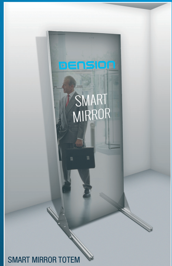
SMART MIRROR TOTEM